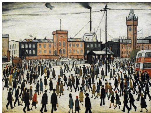
'Going to work' 1943