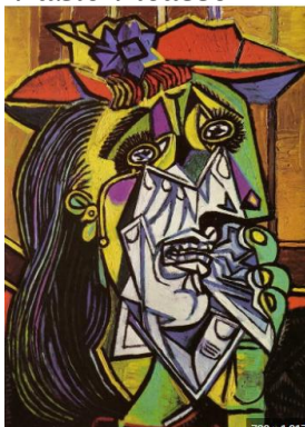
'The Weeping Woman' 1937