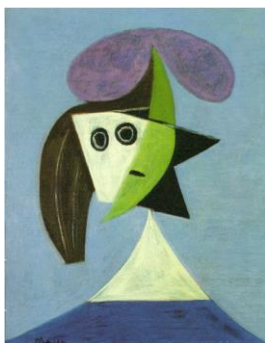
'The woman with a hat (Olga)' 1935