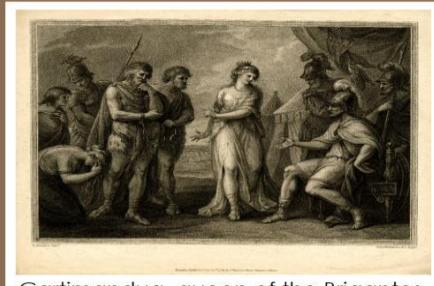
Cartimandua, queen of the Brigantes, cooperated with the Romans and ruled as a client kingdom.