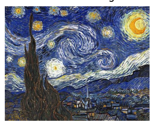
'Starry Night' 1889