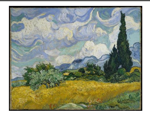
'Wheat Field with Cypresses' 1889