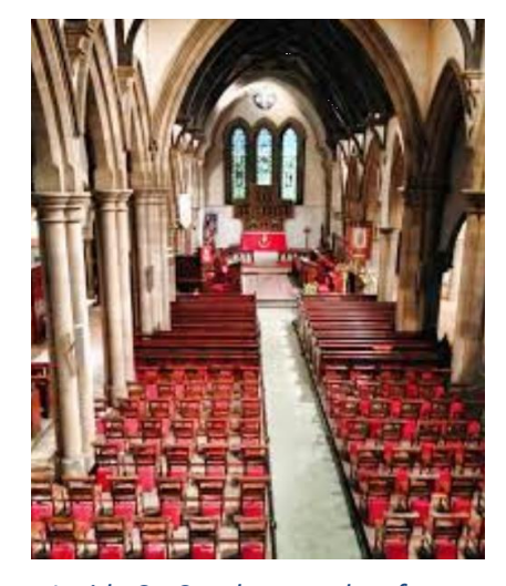
Inside St. Stephens - what features do you remember?

Our big question: What makes some places sacred to believers?